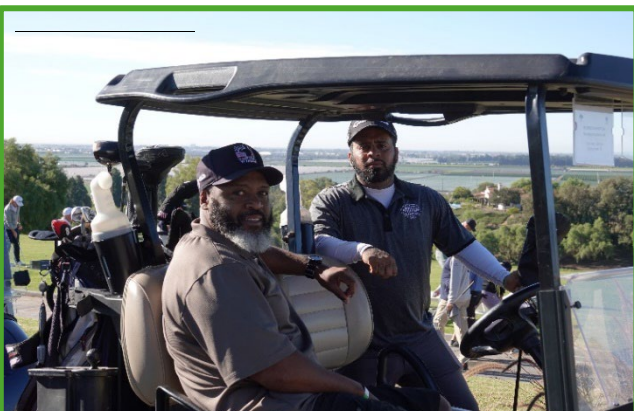
Partnered with the Spanish Hills Club and the Gold Coast Veterans Foundation

To the most deserving men and women amongst us, we thank you for your service and sacrifice. We proudly sponsor a golf program for our veterans suffering from physical, mental, or emotional challenges to help them find peace of mind and improved health and well-being. It's amazing what fresh air, friendship and the light exercise of golf can do.