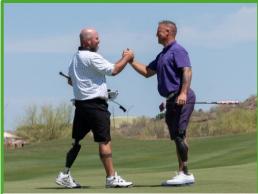
Partnered with the Spanish Hills Club

For those in recovery from challenging mental, physical or emotional setbacks. Program participants learn, or return to, the great game of golf on their own terms at no cost. 24 rounds of free golf for you and a buddy at the Spanish Hills Club in Camarillo, CA. Learn more and apply at: https://recoveryshot.org/program-application/