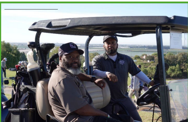
Partnered with the Spanish Hills Club

To the most deserving men and women amongst us, we thank you for your service and sacrifice. We proudly sponsor a golf program for our veterans suffering from physical, mental, or emotional challenges to help them find peace of mind and improved health and well-being. It's amazing what fresh air, friendship and the light exercise of golf can do.