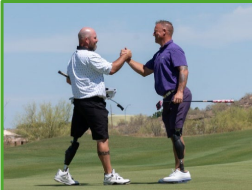
Partnered with the Spanish Hills Club

For those in recovery from challenging mental, physical or emotional setbacks. Program participants learn, or return to, the great game of golf on their own terms at no cost. 24 rounds of free golf for you and a buddy at the Spanish Hills Club in Camarillo, CA. Learn more and apply at: https://recoveryshot.org/program-application/