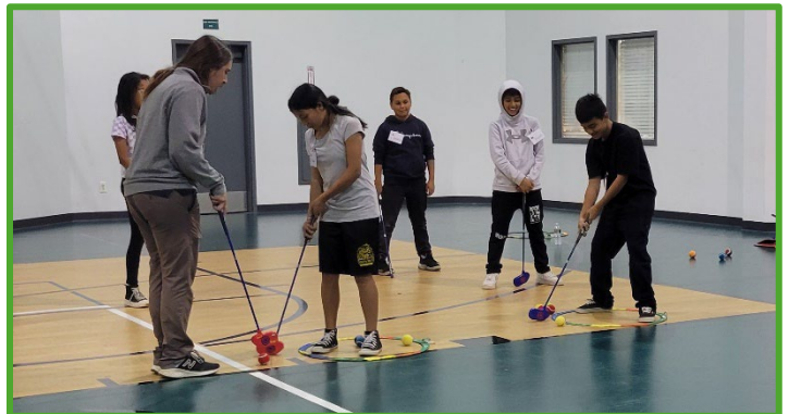
Partnered with the Boys & Girls Club of Oxnard/ Port Hueneme

Underserved children do not have social or financial access to the great game of golf. For the youngsters in Oxnard, CA, Recovery Shot has launched a Youth Golf Program, giving them equal access to the game and its many empowering qualities. For more info go to https://recoveryshot.org/youth-golf-program/